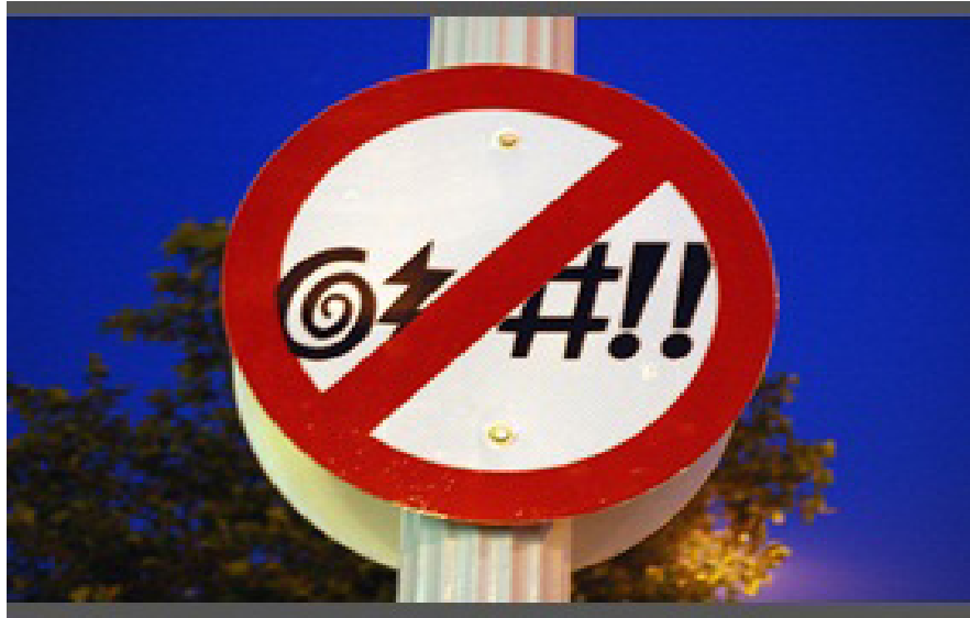
Think twice before swearing in school!

These trends are extremely distressing and so Maryland officials are experimenting with ways to boost literacy and decrease crude language in schools. One potential method of ending this expletive epidemic is strict surveillance. Maryland tech company BigSister is currently negotiating a partnership with the Howard County Public School System to explore the possibility of installing inconspicuous audio distillers that will sound an alarm when anyone curses in the vicinity. Mechanisms such as these have been successful in prisons, and since high schools already have strict schedules detailed by bells and limited outdoor time, another technique used in prisons should fit right in.