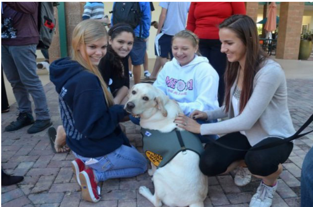
Stress relief puppies are the best way to make students happier.

Get ready to relax and have fun, Marriotts Ridge students, for puppies will be visiting us soon!