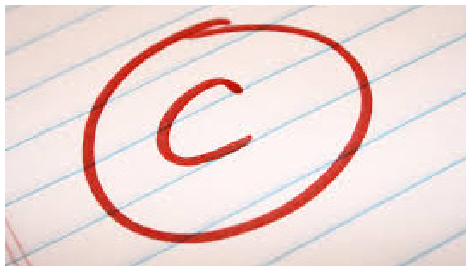
It's no longer okay to fail your midterms!