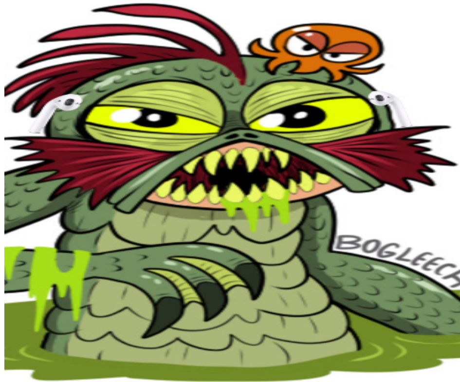
Airpods are mutating humans into strange creatures.

All in all, Apple's new airpods are not as great as everyone thought they would be. They've been causing a lot of different problems for people throughout the world. They have been giving people bad headaches, to the point where they can't even think correctly. That's not where it stops, people have been mutating into completely different animals, and even gaining superpowers. Although all of this is the fault of Apple, they still have no idea how this happened or how they are going to fix it. People now wonder what the "great" airpods are going to cause next.