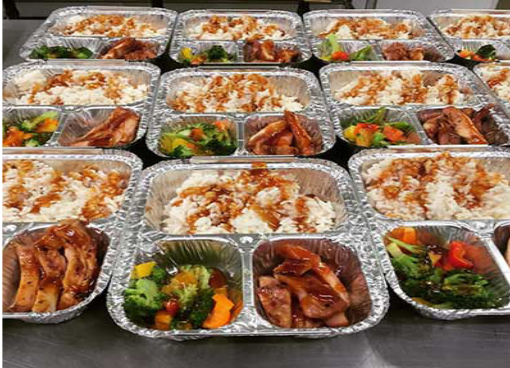
The type of lunches that will be served in the MRHS cafeteria now.