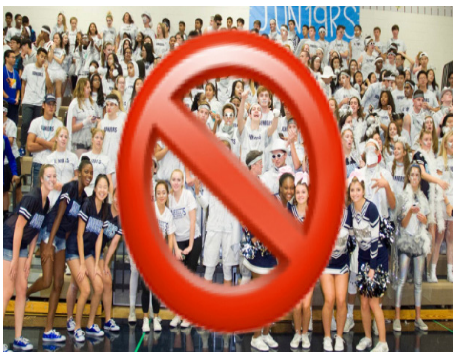
Pep Rallies will no longer exist at MRHS.

Say goodbye to screams and fun, administration is now cancelling all future spirit weeks and pep rallies. There have been threats to this sort of cancellation before, but the school would never follow through with them. Due to many reasons, like the most recent actions of the students at the event and new safety regulations in school systems county wide, pep rallies are deemed unsafe and are being immediately shut down for good. Not only is Marriotts Ridge affected by this disastrous change, but all schools in the county are having to call pep rallies and spirit weeks off starting next year. Meaning juniors will never get their chance in the spotlight and will never have the chance of winning. But why has the school system changed their minds after so long of having this tradition? Shrek, the head of the Department of Ministry, said that “there will no longer be any pep rallies because they are unsafe and are not a requirement to graduate and that’s all that matters.”