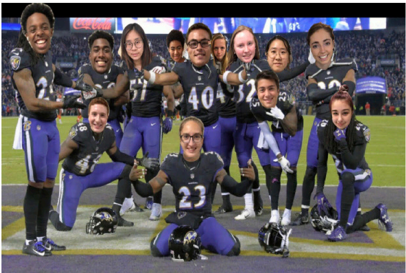
New group photo for the MRHS newspaper staff.

The county is split on this new ruling and does not know what to expect. It will be implemented at