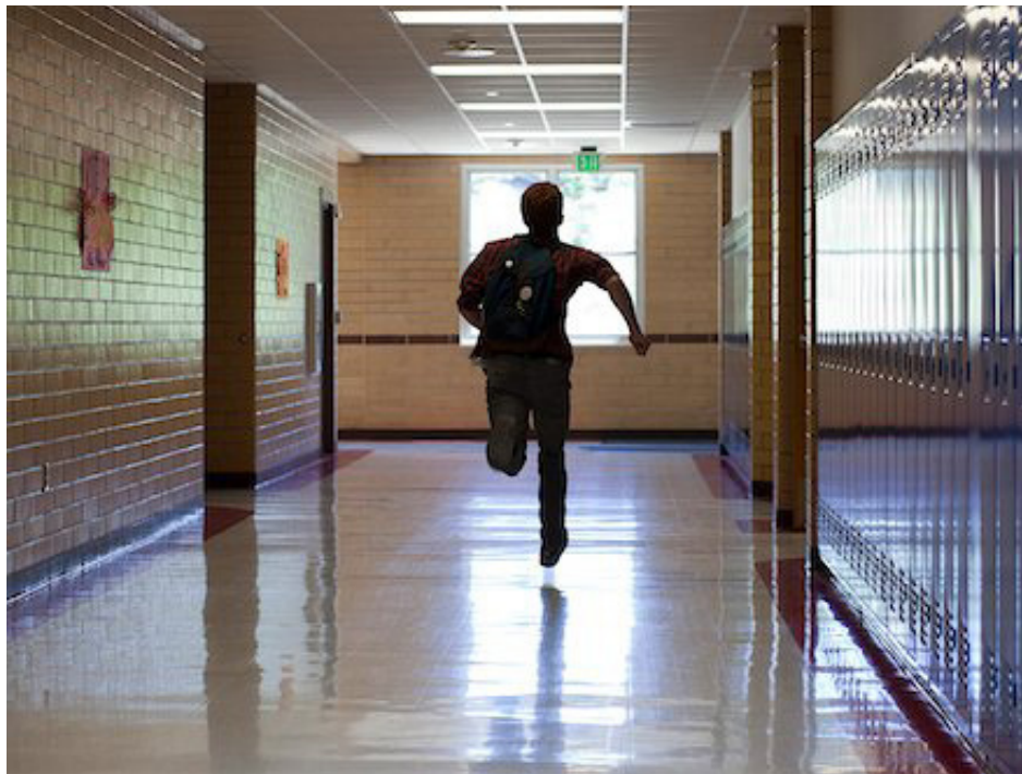
It's time to take your exercise to the school hallways.