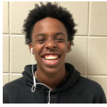
Shad Ctukes Staff Writer

Airpods are the hottest headphones out right now! But could they be dangerous to keep?