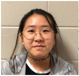
Kbby Aim Staff Writer

To relieve the mustang students of stress, legislation has just past that will allow trained “stress puppies” to be present in all Howard County high schools.