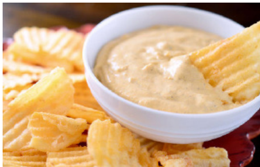
Who doesn't love chips and dips? It's perfect as the theme for a holiday.