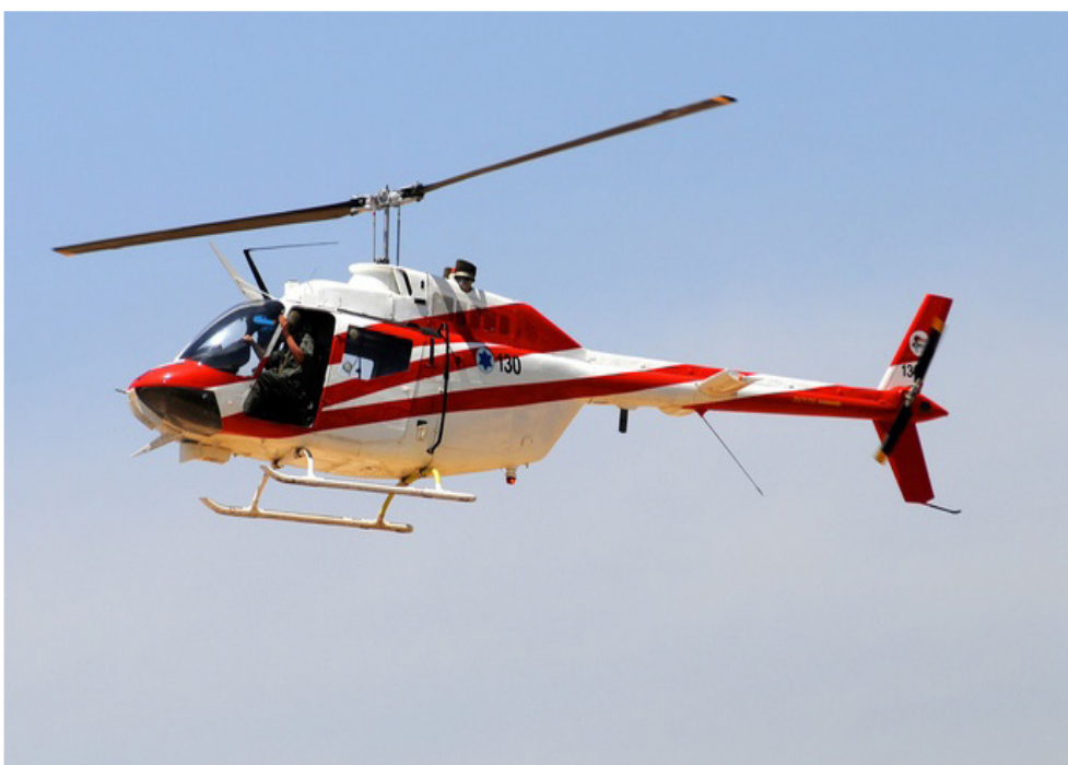
Helicopters are the new form of transportation at MRHS.