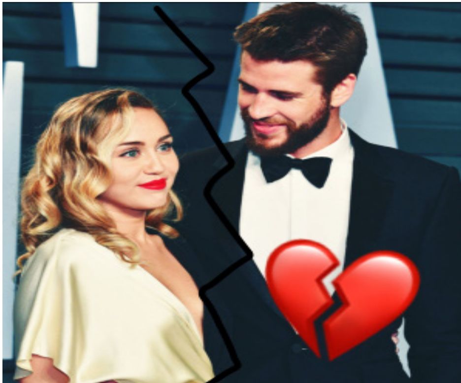
Another wrecking ball hits this famous couple.

ending that people expected. cute photos of each other. “It’s all a front,” says Liam’s older brother, Chris Hemsworth, “Liam tells me all the time how he poses a happy life for the cameras, but is really