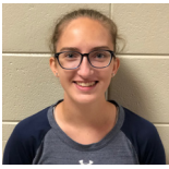
Urace Gnderwood Features Editor

Seniors, get ready for the longest school year yet! The school board has decided that all Seniors must stay in school even after the graduation ceremony until the very last day of school.