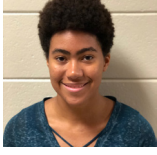
Blivia Orooks Staff Writer

Visit any high school around the state and your ears will in no doubt be greeted with a barrage of colorful language, to put it lightly. A survey conducted by the nationwide organization Mothers Against Profane Pronouncements (MAPP for short) has shown that swearing among students aged 14 to 18 has increased by 23% in the past five years, a truly tragic statistic. The majority of teens surveyed reported swearing “only if I stubbed my toe or something like that,” but a growing percentage is reporting that they swear, “all the time, and with a diverse selection of language.”