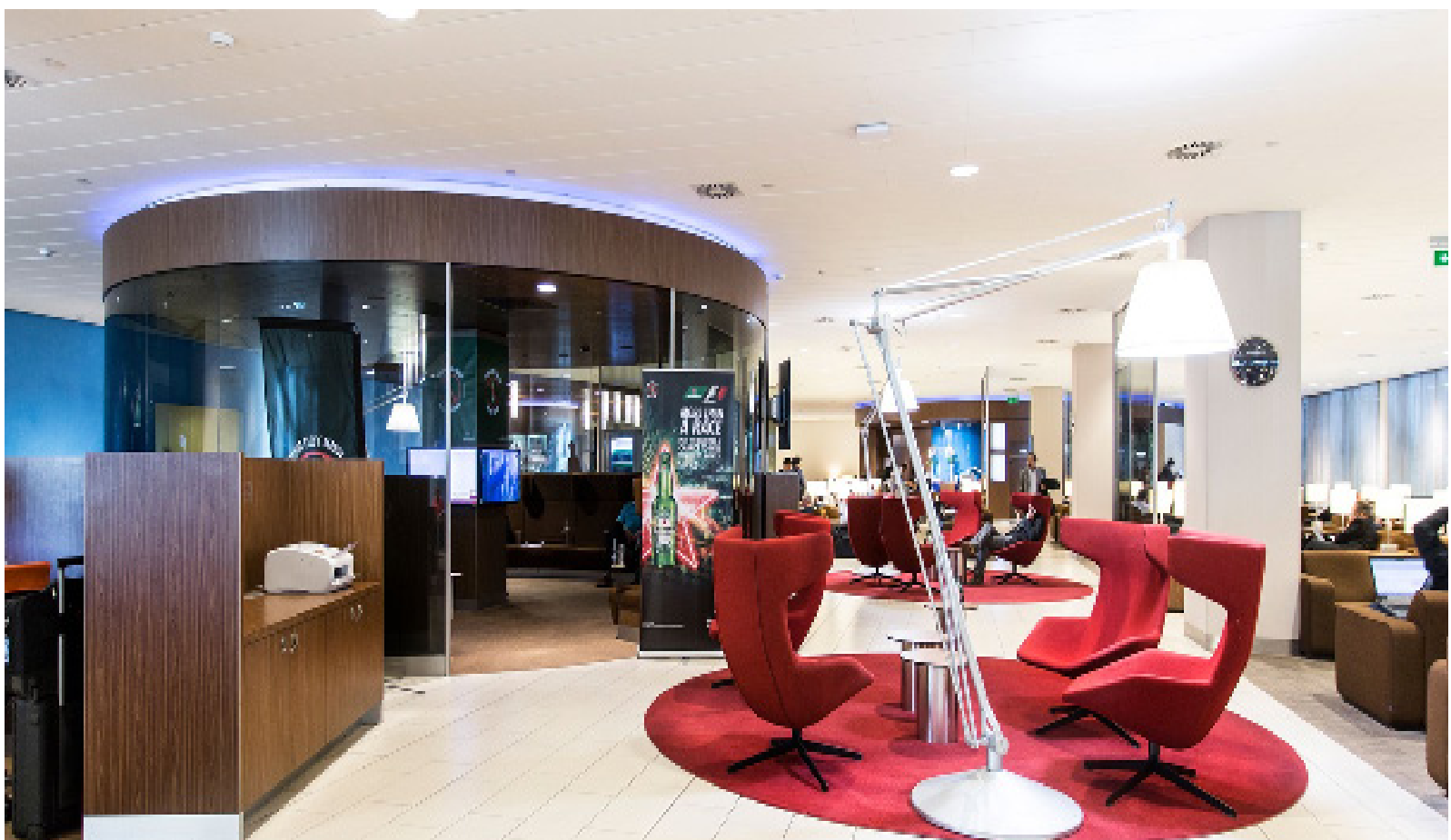
The teachers at MRHS are enjoying a beautiful lounge which caters Chickfila while students can hardly make it through the day. Is it fair?