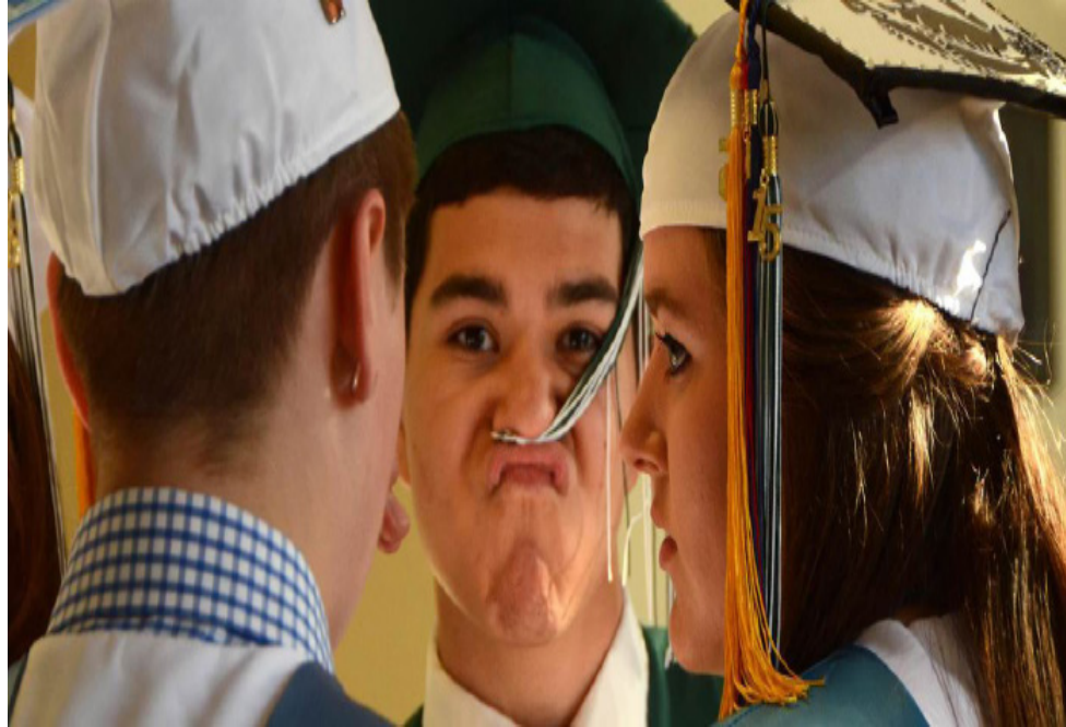
Graduation is hardly the end for seniors this year.

Students and parents are rallying against the school boards verdict. Since the Seniors have already planned such a public protest the school board may consider vetoing their verdict and letting the Seniors leave early anyway.