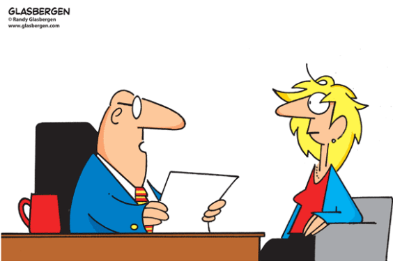
"Any other people skills, besides 400 Facebook friends?"

The training is available at: http://www.hcpss.org/parents/volunteer-information/